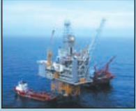
Oil and Gas Monitoring